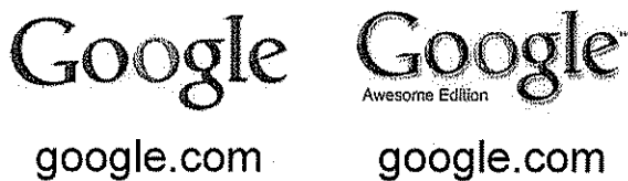
Figure 2 – A pair of Homograph Domains

Traditionally phishing attacks are mitigated through user education, encouraging users to check the legitimacy of links before clicking them, looking for unrelated URLs, not replying to emails asking for information if they are from an external domain name, etc. However when phishing campaigns are modified to make use of homograph domain names the ability for user education to provide mitigate is eliminated, as there is no way to make a visual identification of a fraudulent domain name. Figure 2 shows two domain names, both visually identical, however they lead to separate websites, with the one to the right making use of U+0261 rather than U+0047 for the second G.